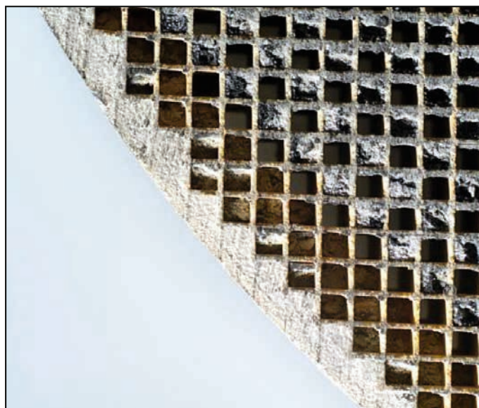
Renault Oxidation Performance